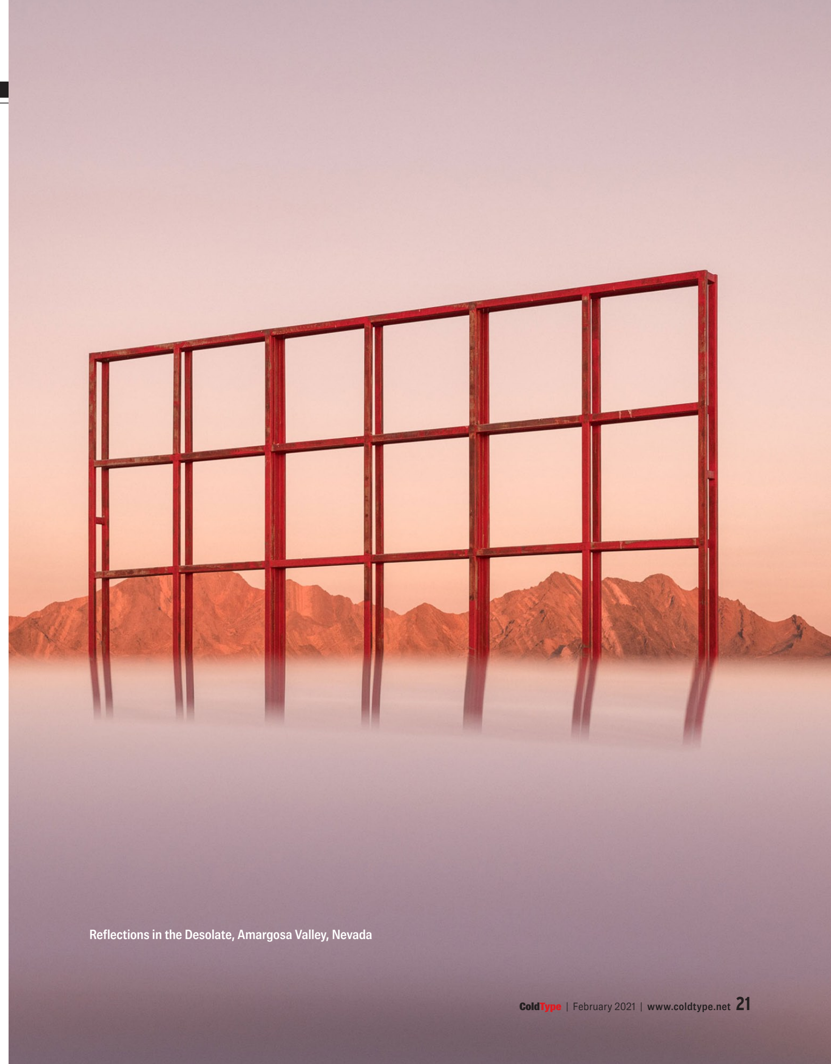
Reflections in the Desolate, Amargosa Valley, Nevada

● Details from Setanta Books at www.setantabooks.com and at www.opendoors.gallery