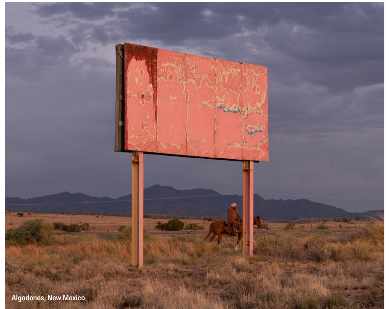
Algodones, New Mexico