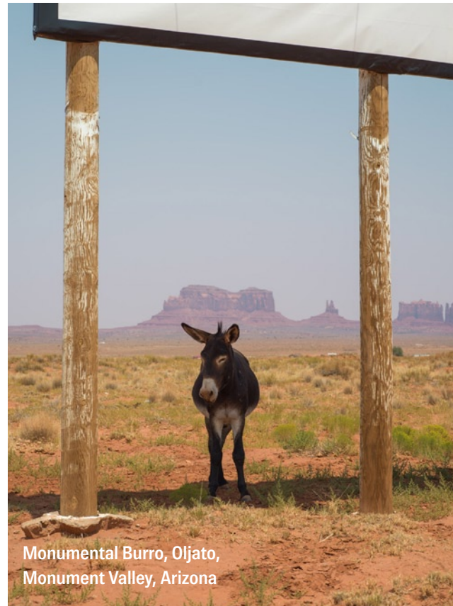
Monumental Burro, Oljato, Monument Valley, Arizona