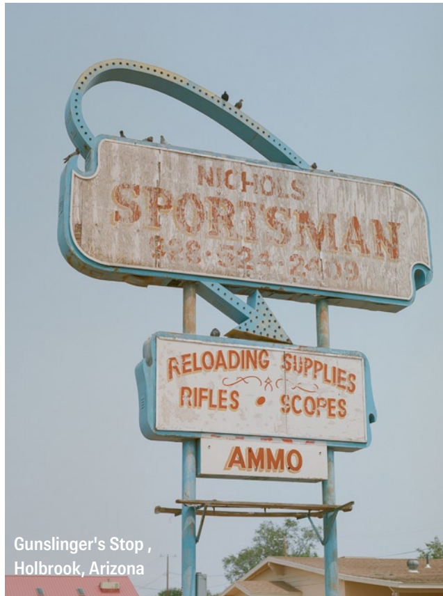
Gunslinger's Stop , Holbrook, Arizona