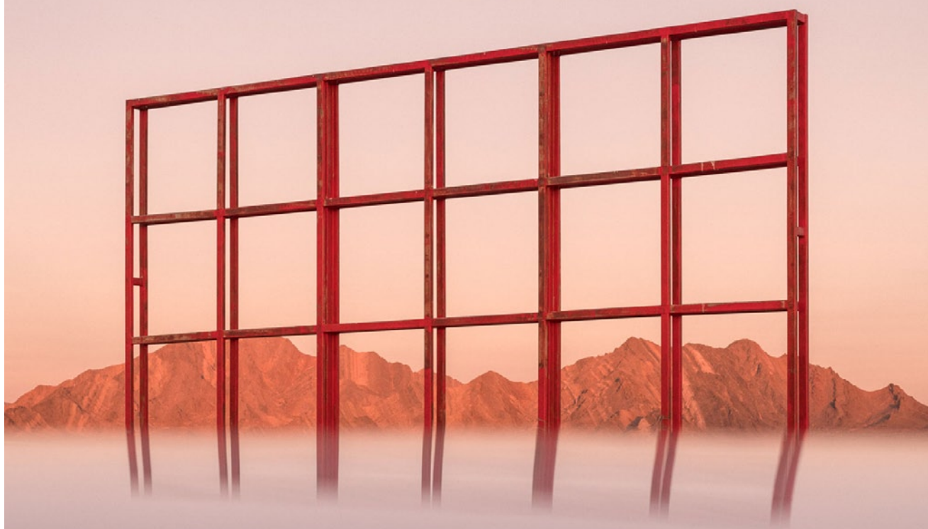
Amargosa Valley, Nevada

WASHINGTON INSIGHTS: SPECIAL 10-PAGE SECTION BEGINS ON PAGE 45