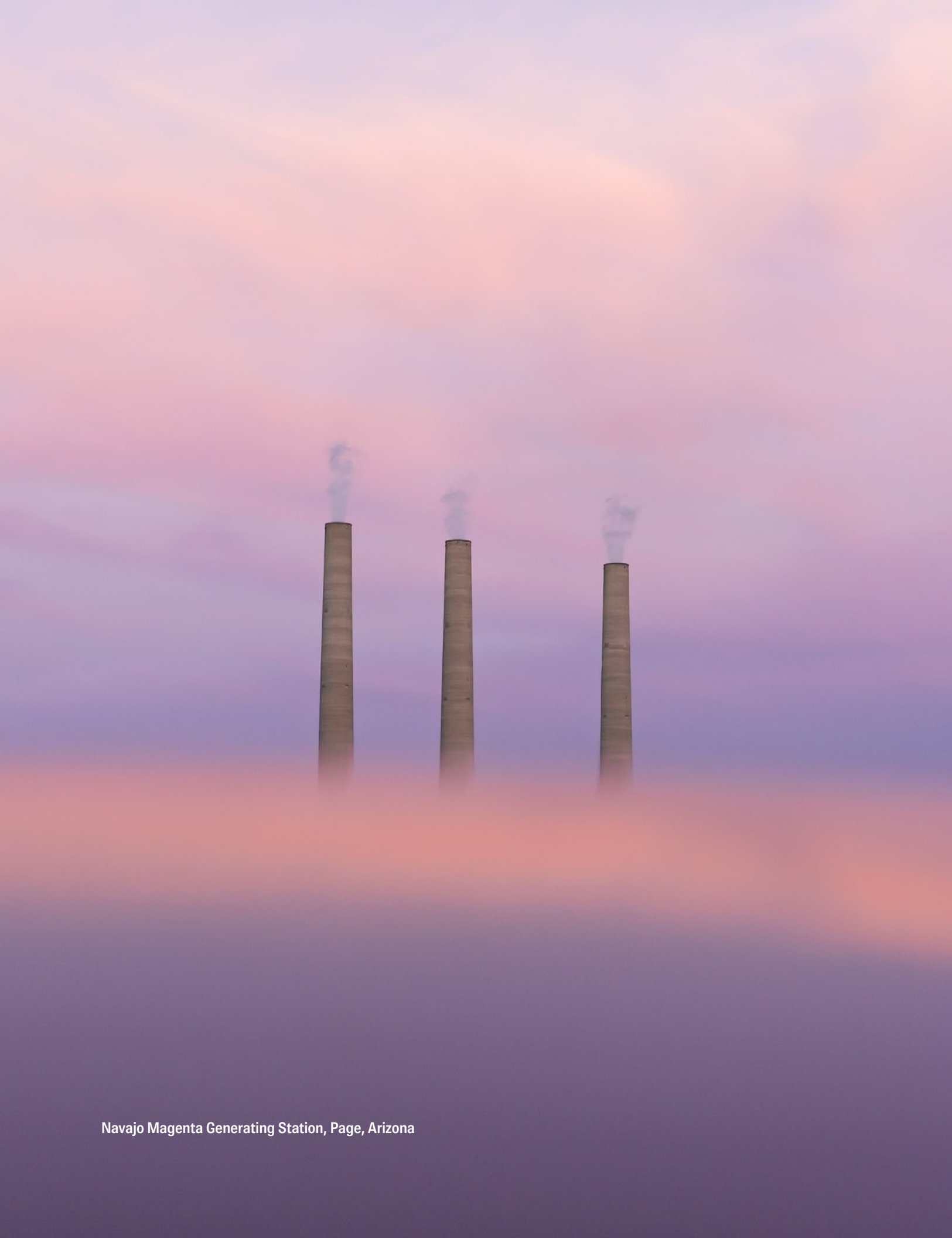
Navajo Magenta Generating Station, Page, Arizona